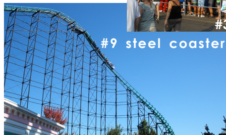
#9 steel coaster