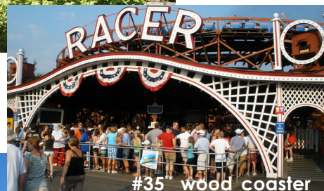
#35 wood coaster