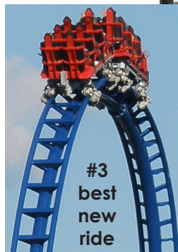
#3 best new ride