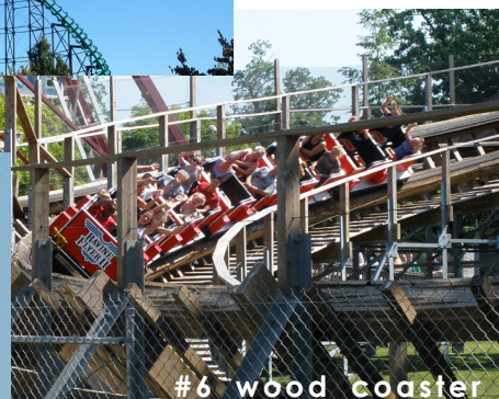
#6 wood coaster